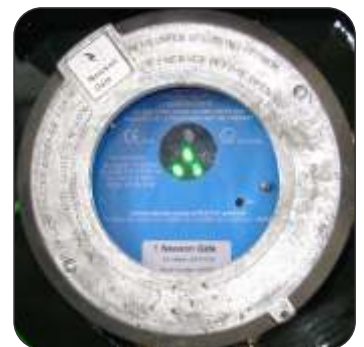
Fig. 3 Earth-Rite® PLUS ground status indicators pulse continuously when grounding is in place.

be interlocked with the power delivered to the pump or PLCs to halt the product transfer operation if the Earth-Rite® PLUS detects a resistance of more than 10 ohms in the ground loop between the rail tanker and the product transfer system. Shutting down the transfer operation ensures the generation of static electricity is stopped thereby eliminating the risk of the rail tanker accumulating a voltage and discharging a static spark which could ignite combustible flammable or dust atmospheres present in the spark discharge gap.